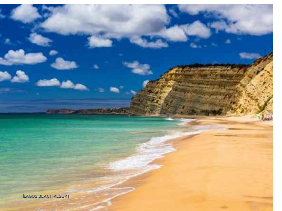
Porto de Mós beach

Located at the west boundary of the city of Lagos, Porto de Mós beach offers a privileged location for those seeking tranquillity while being close to everything.